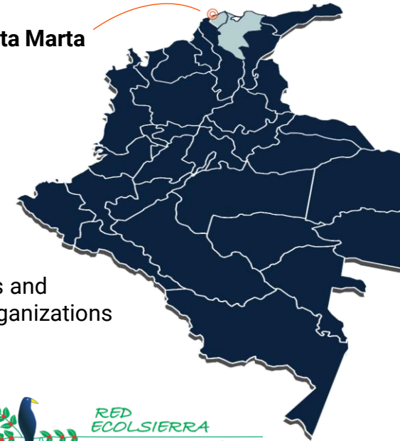
COLOMBIA - Santa Marta Sierra Nevada

11 Partners Coffee Cooperatives and Collective organizations